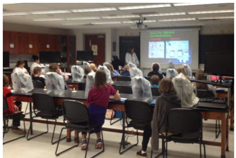
5 th and 6 th grade girls from Alger and Marquette counties, attending a lecture as part of the conference.