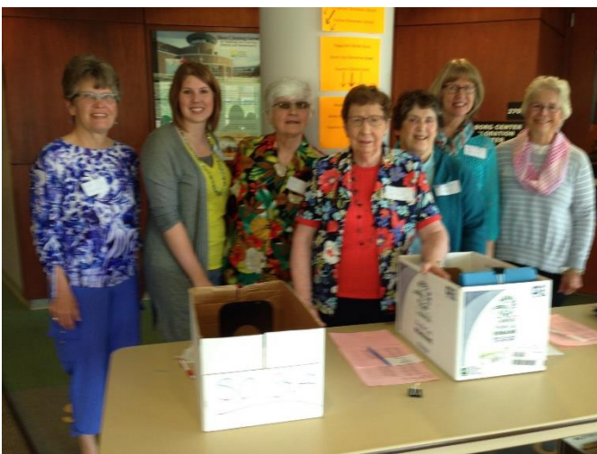
AAUW members ready to welcome participants to the STEM conference held in the Seaborg Center at Northern Michigan University